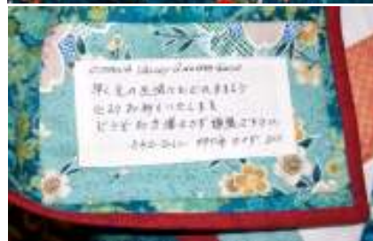
Label on quilt above