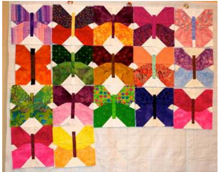
Block of the month submissions for the month of May, 2011