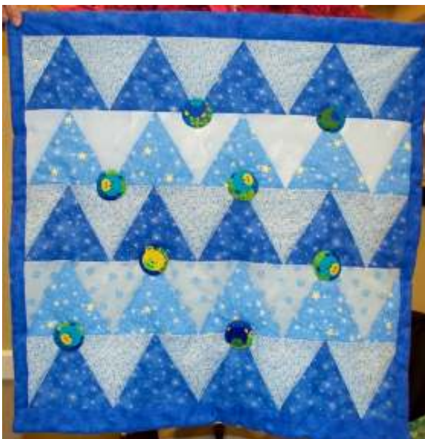
A baby quilt going to Japan