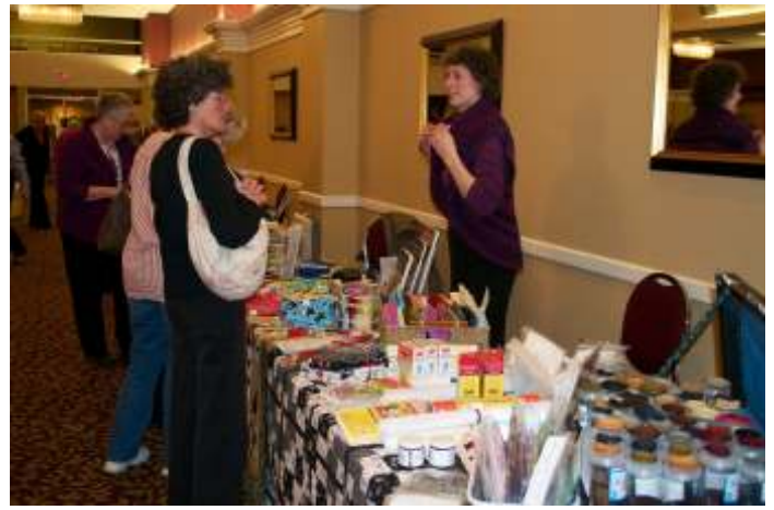
Shop of the month—Textile Traditions